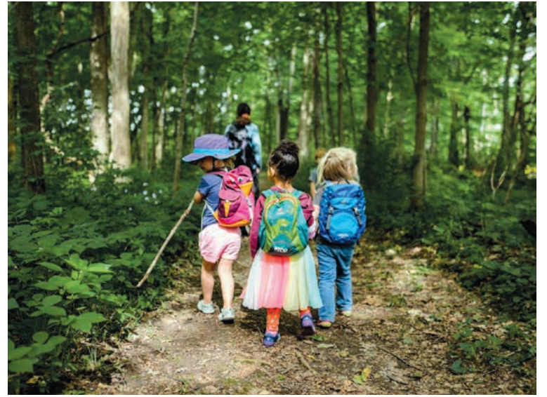
The Partners for the Environment Fund