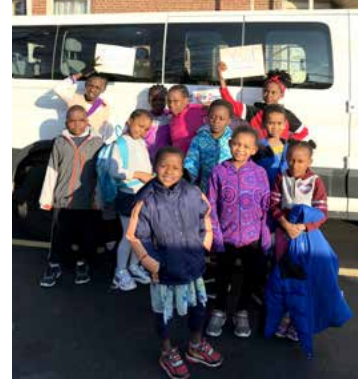
Kids in New Directions

Kids in New Directions (KIND) ($5,000) to purchase a van to include more students in its foundational learning program.