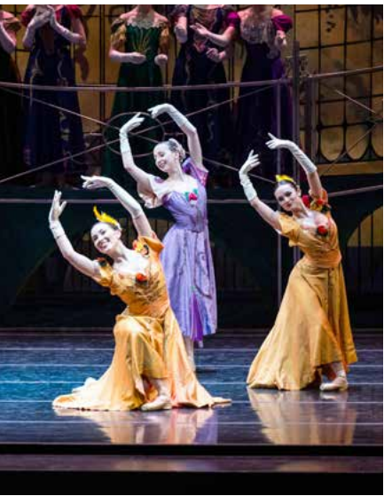
Dayton Performing Arts Alliance

The Foundation's discretionary and Greenlight Grants programs are made possible by donors who have provided unrestricted or lightly restricted funds. These funds enable the Foundation to act on opportunities for the community and address pressing needs throughout the region.