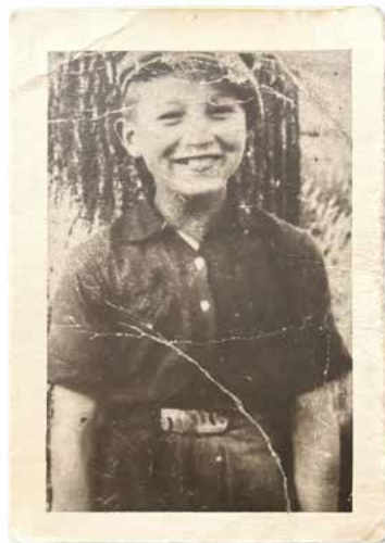
Jewish Federation of Greater Dayton

Greater Edgemont Community Coalition ($5,000) to automate popcorn shelling and harvesting processes for its popcorn pilot project.