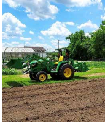
Greater Edgemont Community Coalition

Greater Dayton Volunteer Lawyers ($3,000) to provide strategic planning services for the organization's pro bono program.