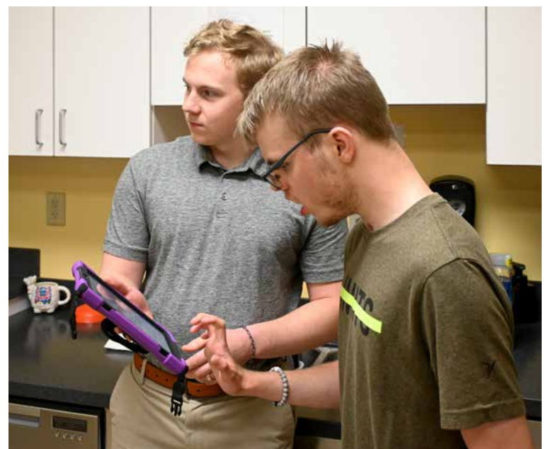
United Rehabilitation Services

United Rehabilitation Services ($4,000) to complete the organization's Adapted Therapy Apartment, including purchasing and installing assistive technology to better serve clients.