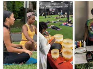
Spectrum New Beginnings

RaiseSTEM! ($2,500) to construct a 120-pound robot for outreach and recruiting events.