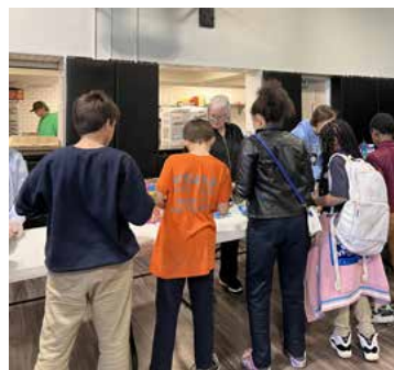
Dayton Dream Center

Dayton Dream Center ($6,000) to launch phase one of the "Roadmap for Recovery" program, which includes purchasing software to track clients' engagement.