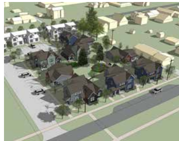
Yellow Springs Home

Wright Dunbar ($50,000) to construct a memorial that pays tribute to 40 Medal of Honor recipients and 100,000 veterans living in Greater Dayton.