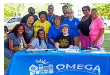
Omega Community Development Corporation

Omega Community Development Corporation ($7,500) to create a community garden for participants of its food outreach program, many of whom are food insecure.