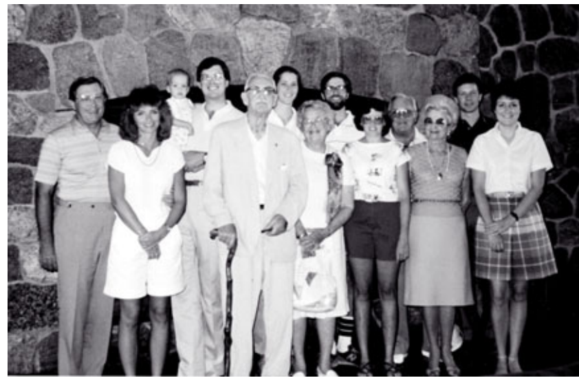
Four generations of the Neff family in the early 1980s