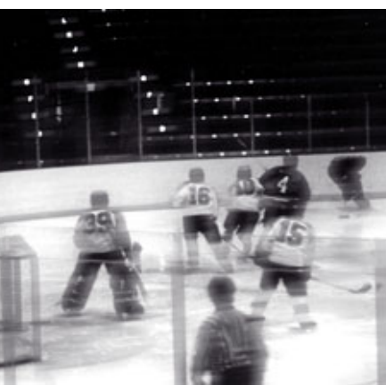
Beavercreek Hockey Program

Establishing a strong foundation for our community's future is a vision shared by donors who have endowment funds at The Dayton Foundation. Donors have started 17 new endowment funds recently to support our region and their special charitable causes, now and in the future.