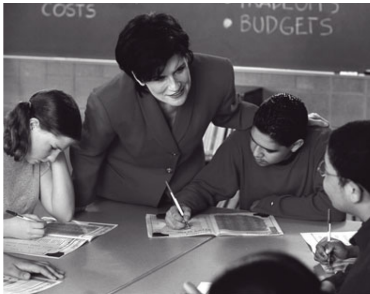
Junior Achievement has benefited from the new Legacy Partnership Program.

help local not-for-profit organizations to establish or build endowment programs through the Foundation that will help ensure the long-term stability of services and programs in the community. Currently 26 organizations in the Miami Valley are participating in the program, with another 20 scheduled to begin over the next few months.