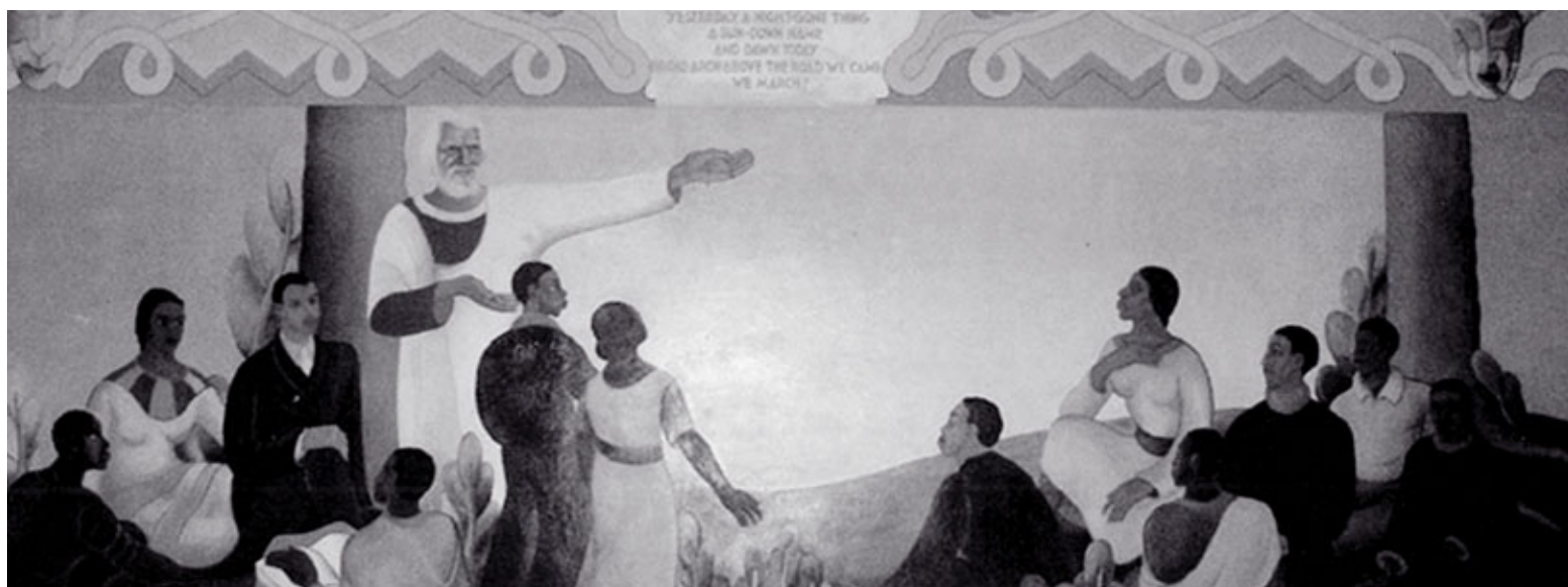
The mural, Douglass Inspiring the Youth of the Negro Race , will be restored and preserved with help from a grant to Culture Works.

To help preserve and restore Dayton's only remaining public work-of-art project mural, The Dayton Foundation awarded a $2,000 grant to Culture Works, the fiscal agent for the project. The mural, Douglass Inspiring the Youth of the Negro Race ,