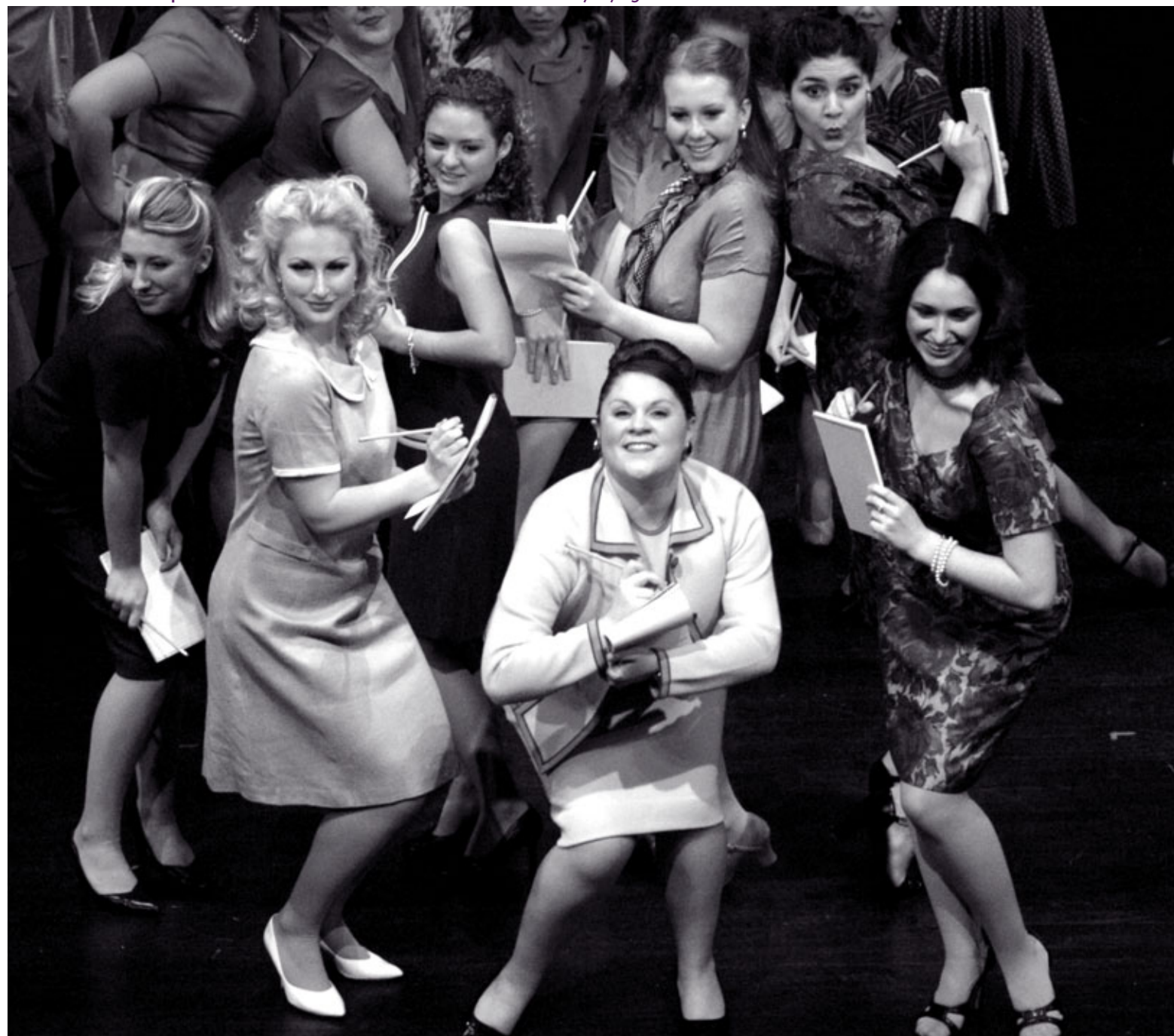
The Muse Machine's production of How to Succeed in Business Without Really Trying

* The Lima Community Foundation Funds ** The Vandalia-Butler Foundation Funds