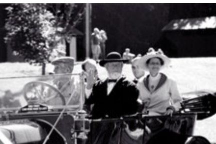
"Wright Family" in Carillon's Time Flies

An $8,000 grant will assist Carillon Historical Park to incorporate the sets, costumes and scripts used for Time Flies: Catch it in the Act (produced for the Centennial of Flight celebration in July 2003) into the Park's permanent educational programming.