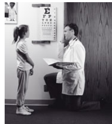
KIND's children receive medical attention, thanks to a Dayton Foundation grant.

The project parallels a Dayton Foundation leadership initiative to support educational programs for our region's youth. Over the last five years, the Foundation has granted more than $1.5 million to a number of organizations, including East End Community Services, Dayton Boys and Girls Club, the Children's Hunger Alliance and KIND for after-school and summer youth educational