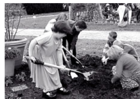
Wegerzyn Children's Garden

individuals with acquired brain injuries, severe mental illness or learning disabilities to build life, job and communications skills through arts programs.