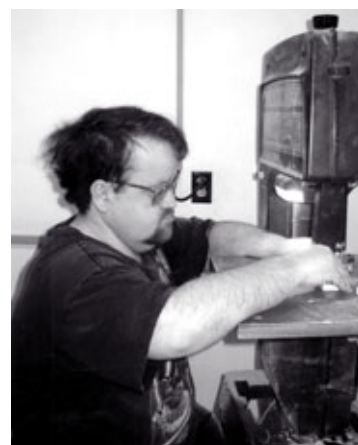
We Care Arts

To assist in renovating the organization's facility to be compliant with the Americans with Disabilities Act, the Foundation awarded a $10,000 grant to We Care Arts. The renovated facility will provide a larger, safer environment for