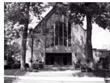
St. Paul's Episcopal Church

Muse Machine enriches the lives of area youth by providing students and educators with opportunities to experience and value the arts.